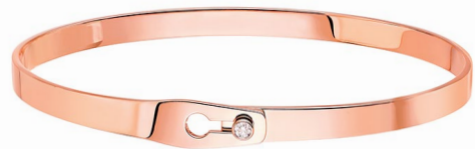
Serrure Ruban bracelet available in yellow gold and diamond, pink gold and diamond, or white gold and diamond