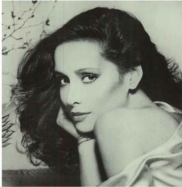
Vogue US - December 1978

At the beginning is a gold bangle relieved of any mechanism. Flexible enough to be opened, rigid enough to not be deformed.