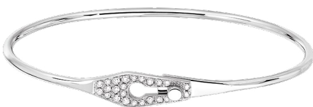
Serrure Jonc bracelet available in yellow gold and diamond, pink gold and diamond, white gold and diamond or white gold and diamonds