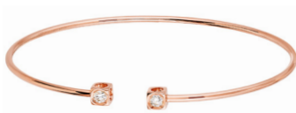
Le Cube Diamant bracelet, pink gold and 2 diamonds