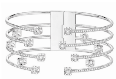
Le Cube Diamant cuff, white gold and diamonds