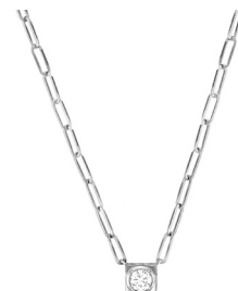
Le Cube Diamant large necklace, white gold and diamond