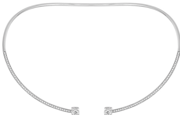
Le Cube Diamant large necklace, white gold and 2 diamonds