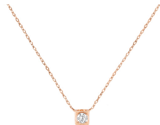
Le Cube Diamant medium necklace, pink gold and diamond