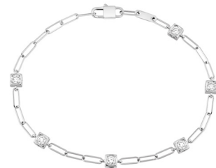
Le Cube Diamant chain bracelet, white gold and 6 diamonds