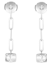
Le Cube Diamant pendants, white gold and diamonds