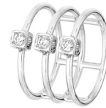
Le Cube Diamant ring, white gold and 3 diamonds