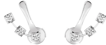
Le Cube Diamant earrings, white gold and 6 diamonds