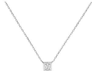
Le Cube Diamant medium necklace, white gold and diamond