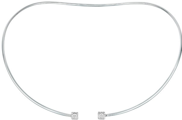
Le Cube Diamant small necklace, white gold and 2 diamonds